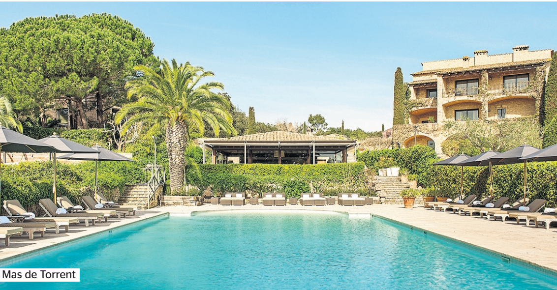
Mas de Torrent

It’s adults only. It has a private beach, accessed by movie-set stone stairs from its cliffside location. And it’s in ravishing Aiguafreda, a crinkly coast of crystalline coves and umbrella pines. Honestly, if you don’t propose to your loved one here, you’re never going to do it. The hotel itself is the perfect setting, with an angular pool that juts out over the sea, and a hillside terrace restaurant just asking to be plastered across social