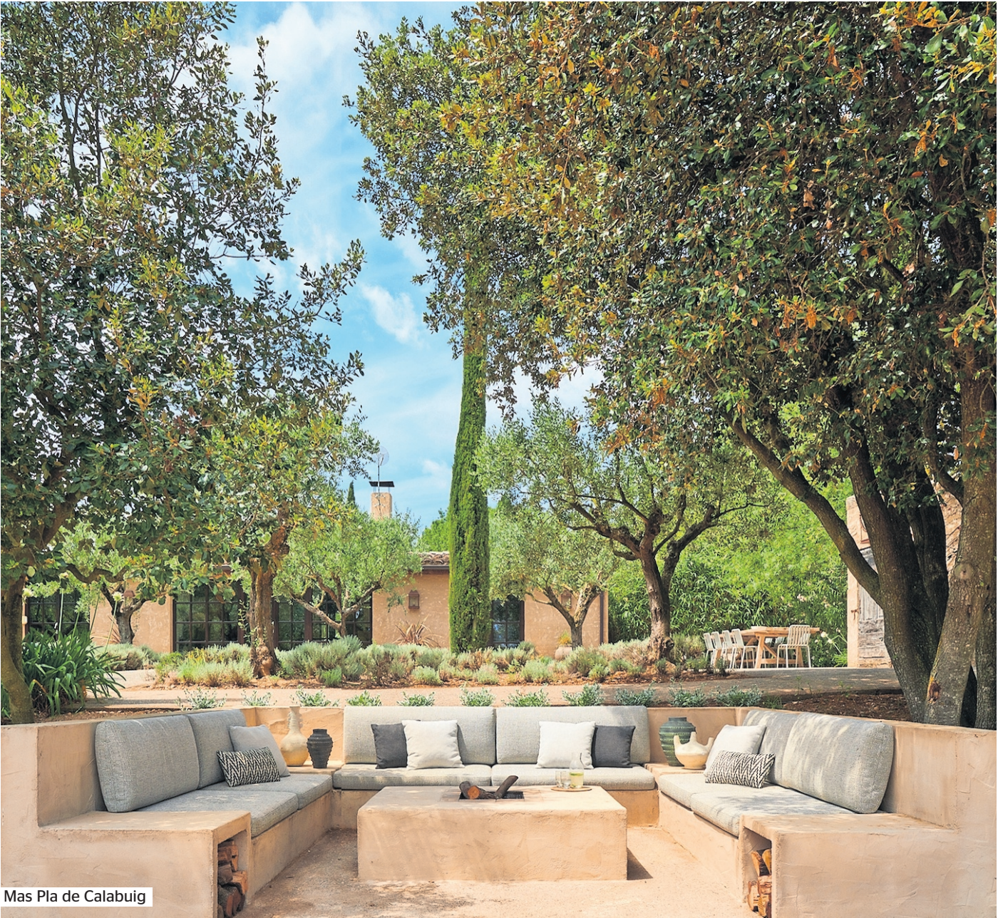
Mas Pla de Calabuig