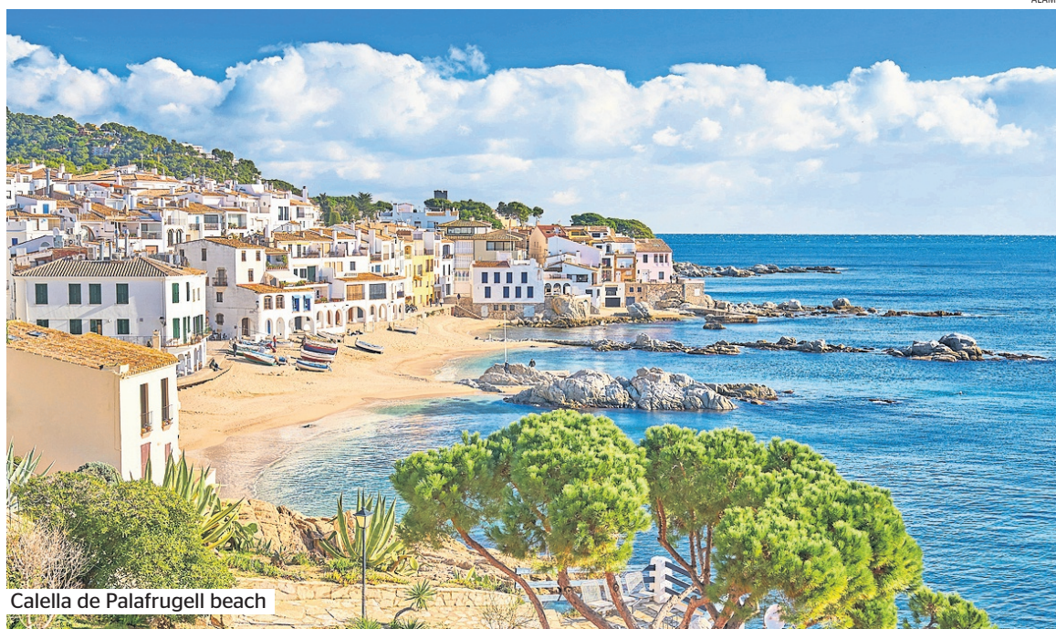
Calella de Palafrugell beach

With old-school appeal and a regular roster of repeat guests, this one's a stroll from Platja d'Aro and is popular with a French crowd. Check in for shady